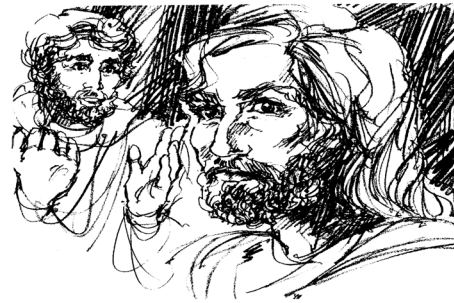
Jesus rebuked Peter: "Get behind me, Satan!"